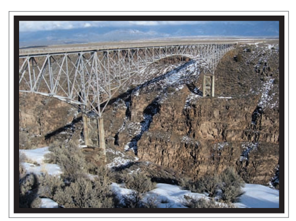
Rio Grande Gorge Bridge near Taos, New Mexico

Starting in art-rich Santa Fe, with its galleries,